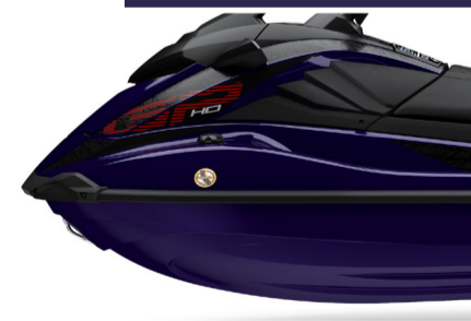
RACE DESIGNED HULL