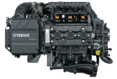
TR-1 MARINE ENGINE