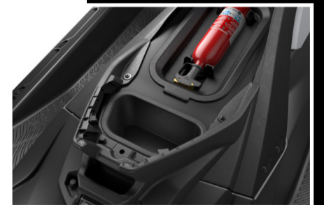
UNDER SEAT STORAGE