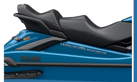
THEATRE STYLE SEAT