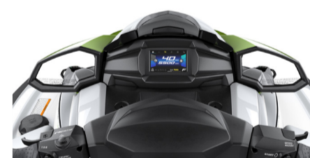
4.3" CONNEX SCREEN