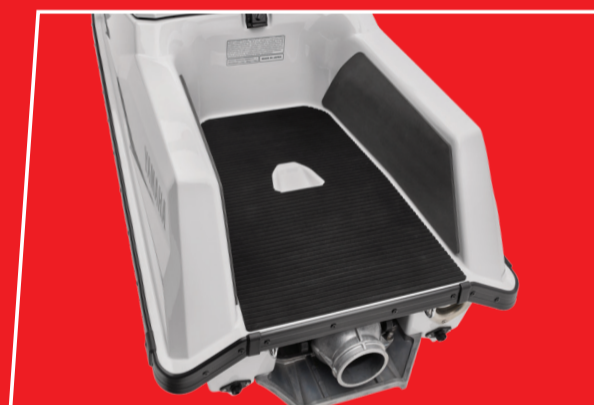
Reboarding Grab Handle