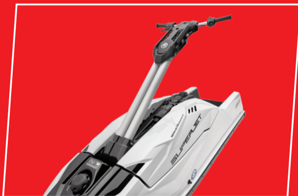
3-Position Adjustable Race Handlebar