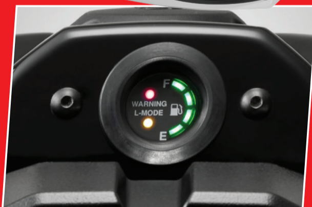
Fuel Gauge + Learning Mode Indicator