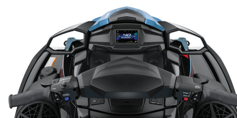
4.3" CONNEX SCREEN