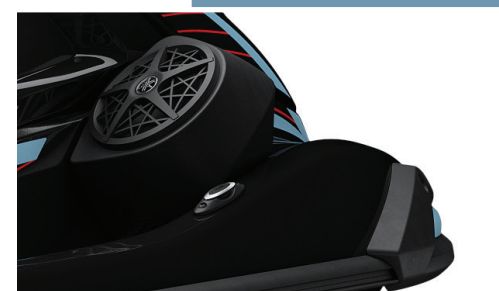
2 x PULL-UP CLEATS