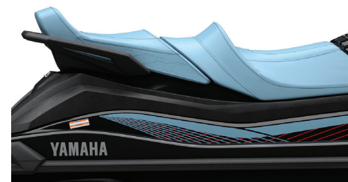
THEATRE STYLE SEAT