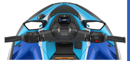
RiDE Dual Controls